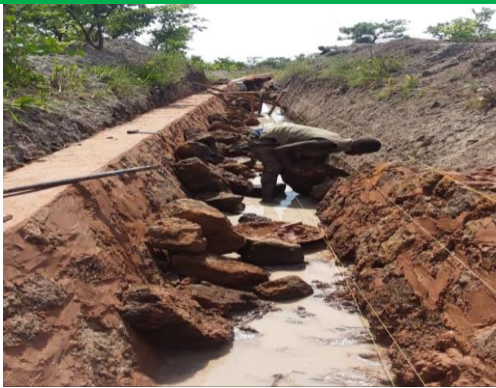
Plate: Lining of the Main Canal in Gwanumpu Irrigation scheme on progress, Kakonko DC