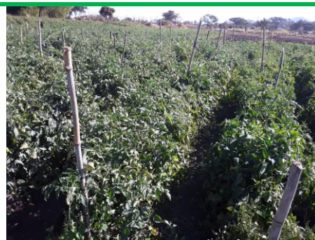
Plate4: Tomato Field in Lipuli Irrigation Scheme, Iringa DC