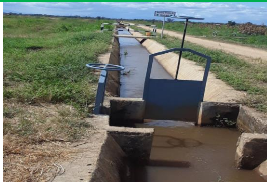
Plate2: Main Canal in Mvumi Irrigation Scheme, Kilosa DC